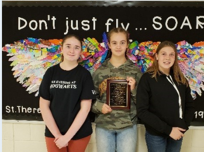
Catholic Leadership Team