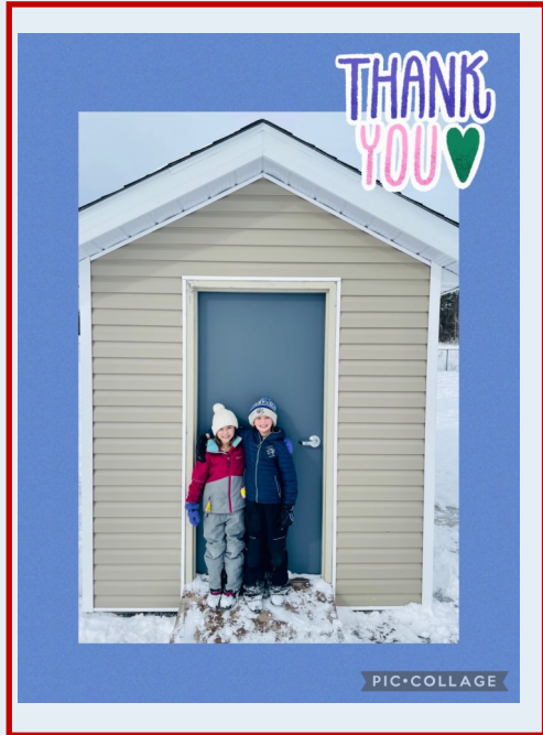
St. James School project photos